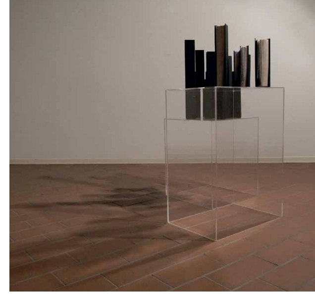
Knowledge of the Limited Responsibility Society, 2012

The title of the exhibition derives from an archival documentary film about the construction of the biggest European dam at the Danube River in Serbia 1969, which comprises a part of Lagator's installation Forward Play Reverse , created especially for the exhibition at KU Linz. This quotation, taken from a narrative focused on the future of a country that ceased to exist (Yugoslavia), functions as a reminder of the dystopian consequences of all modernising projects.