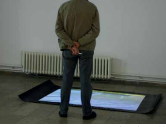
Temporary Dumping Place. Rotations in Given Space, 2004

Irena Lagator Pejović represented Montenegro with a solo show Image Think at the 55th International Art Exhibition – La Biennale di Venezia in 2013. Other important solo shows: Limited Responsibility Society (L.L.C) , Villa Pacchiani, Santa Croce sull'Arno (2012) and Salon of the Museum of Contemporary Art, Belgrade (2012), What We Call Real , National Museum of Montenegro, Cetinje (2008), Is it Still Winter Outside? , Museum of Contemporary Art, Banja Luka (2007).